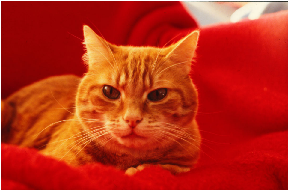
Müsterli . Diapositive (Kodak Ektachrome 400) of the cat Müsterli in a chair. Digital scan (6560×4304 pixels). 1980s.