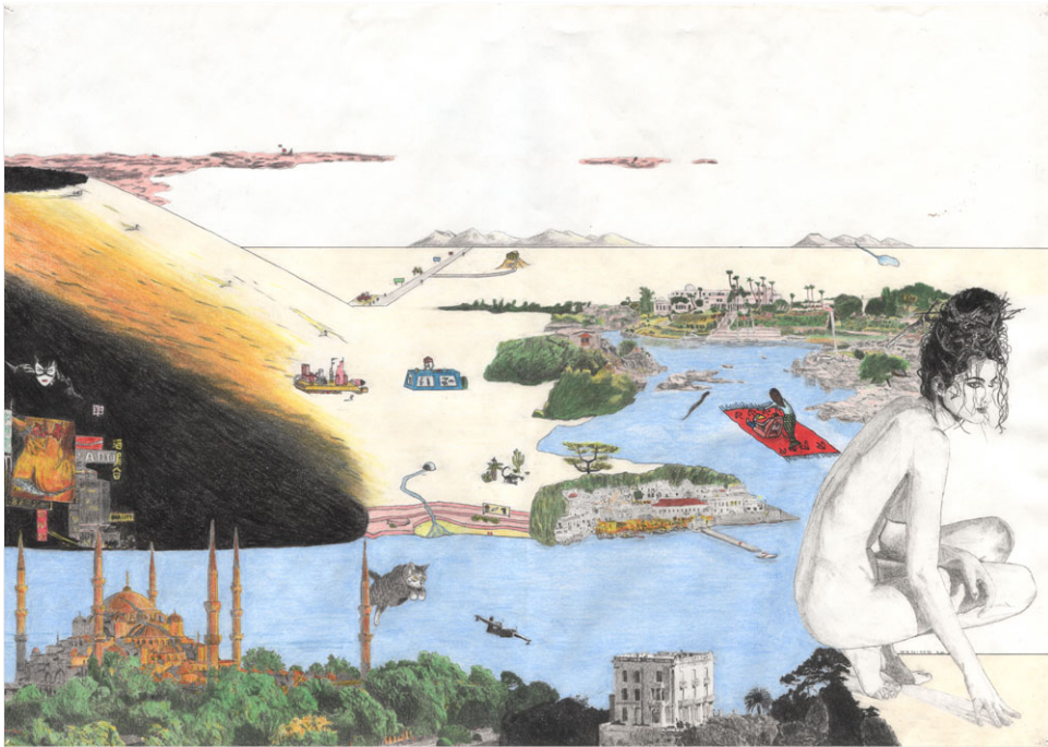
Fly like an eagle . Crayon and felt pen on marker paper (A3). Inspired by a dream. Includes traced "copies" of several photos from magazines, including from Egypt near the Aswan Dam, Mykonos, Istanbul, Hawaii, and Monaco with airplane+house (by Helmut Newton); the lady in the front is from an ad for Opium perfume by Yves Saint Laurent. 1992/93.