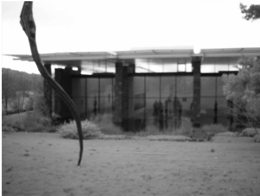
Artemis . Digital photo (2592×1944 pixels) in the infrared spectrum. Taken at Fondation Beyeler; silhouettes include sculptures by Alberto Giacometti (left, behind windows) and Louise Bourgeois (right, behind windows, plus one leg of Maman in front). The hourglass silhouette to the right could not be identified on non-infrared images taken shortly before+after. 2011.